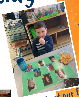
Placemats of our friends and teachers faces at snack time