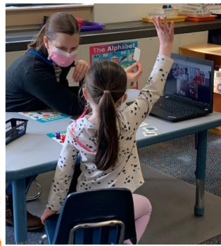
Turn taking games