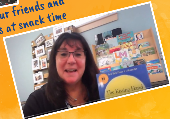
Sharing videos at school and home to support transitions