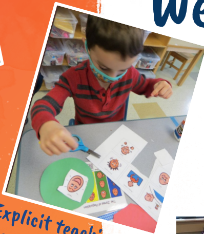
Explicit teaching skills, such as the Zones of Regulation