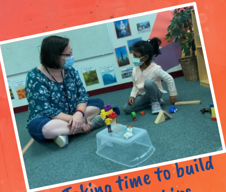
Taking time to build relationships