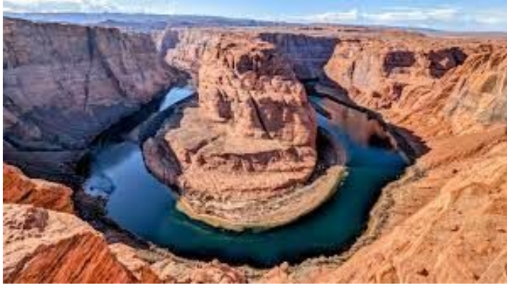
Viewing Horseshoe Bend