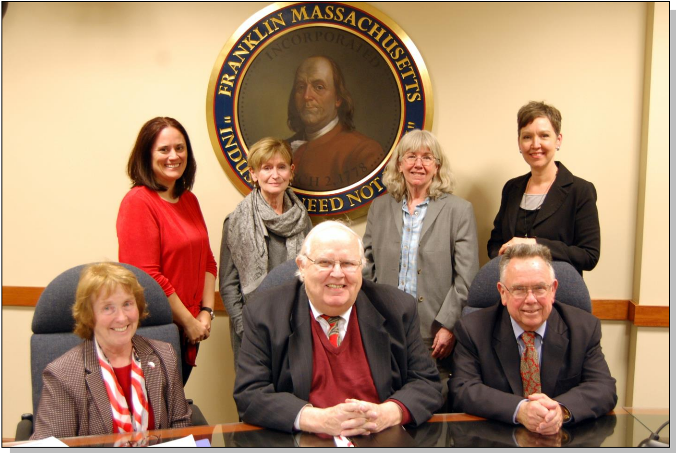
Franklin School Committee 2016-2017