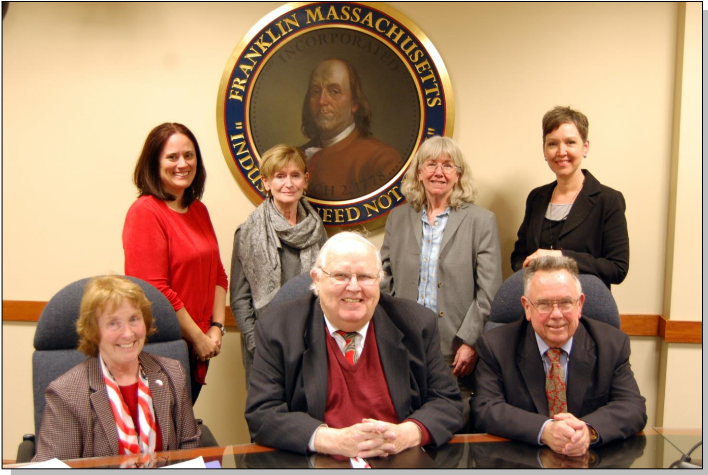
Franklin School Committee 2015-2016